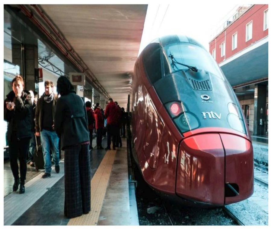
An Italian train station. In April, private-equity firm GIP purchased Italy's second-largest high-speed train operator, known as Italo.